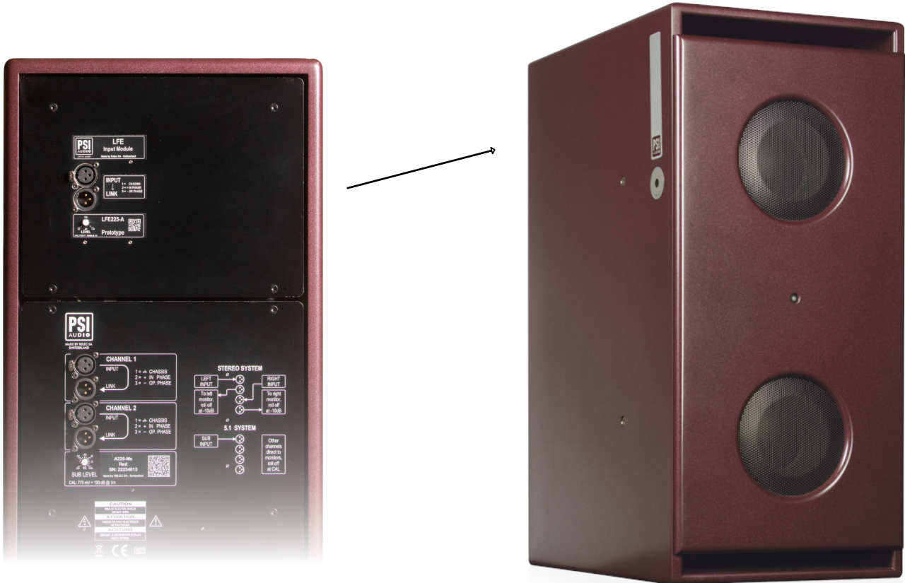
SPL@ (-10dBu ; 1m)

The LFE Module is the missing link for those who want to work in immersive environments. Thanks to its frequency range from 24Hz to 160Hz, it meets the Dolby Atmos standards. Moreover, a potentiometer allows you to manually adjust the level from -10dB to +10dB. The LFE Module is installed in place of the blank panel of your existing Sub A225-M*. Max Peak SPL: 117.5dB in anechoic environment.